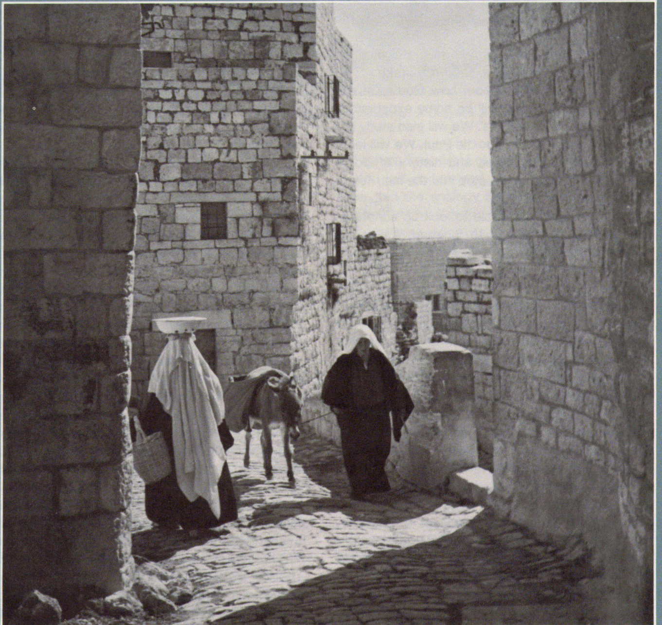
The New Testament Church