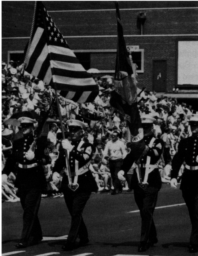
A Memorial Day parade.

The Passover is the first of God's seven annual festivals which outline His master plan. The peoples of the world have rejected and forgotten God's festivals. If we, like the world, reject these days we will also forget His plan — we will forget the knowledge of the purpose of