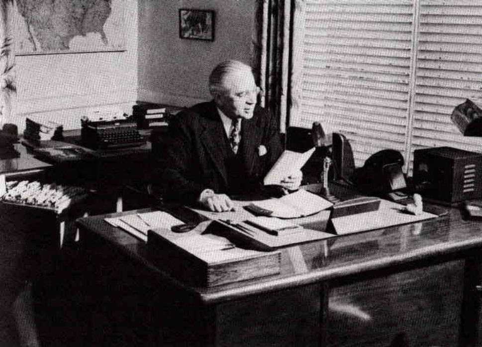
PHOTO SHOWS Herbert W. Armstrong making an early World Tomorrow radio broadcast. From the smallest beginnings, God's work has grown to international scope, carrying the true gospel to all the world as a final end-time witness.