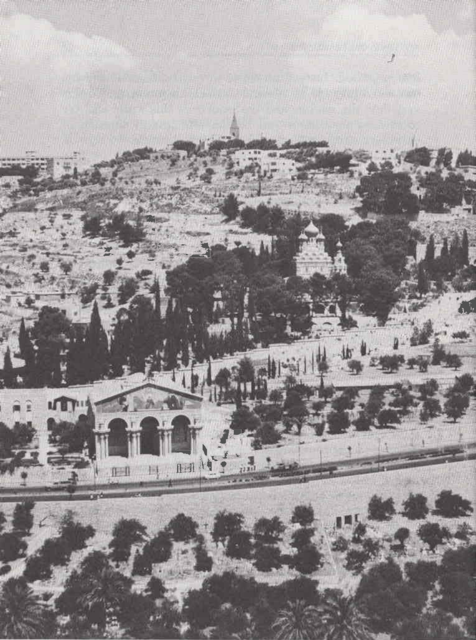
THE MOUNT OF OLIVES as it looks today. It is at this very location that Jesus Christ will soon return to earth to set up a peaceful and just world government.