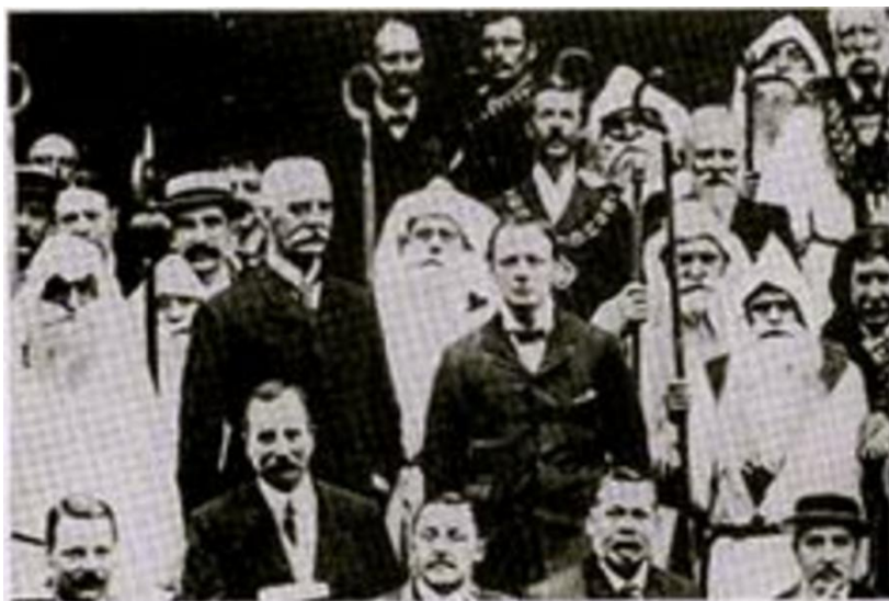
Winston Churchill being installed into the Albion Lodge of the Ancient Order of Druids at Blenheim Palace, 15 August 1908.

equated to how much of a DRUID you can become! So the title of the radio program should be renamed as “ Become You Therefore Druids! ” This is actually DOUBLE DEALING, i.e., an action characterized by treachery or deceit!