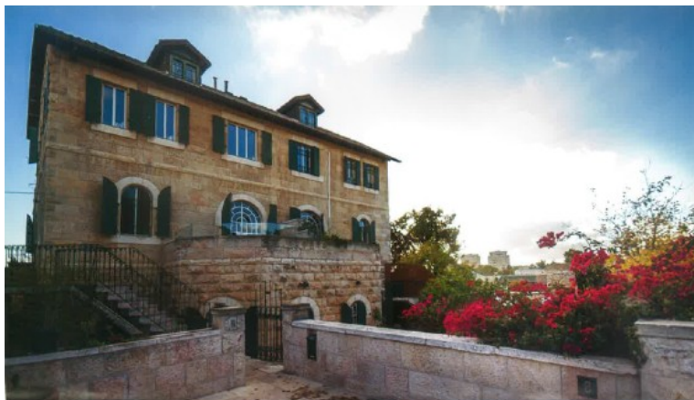
Mizpah - the main office for the PCG in Jerusalem, which also served as the girls' dormitory