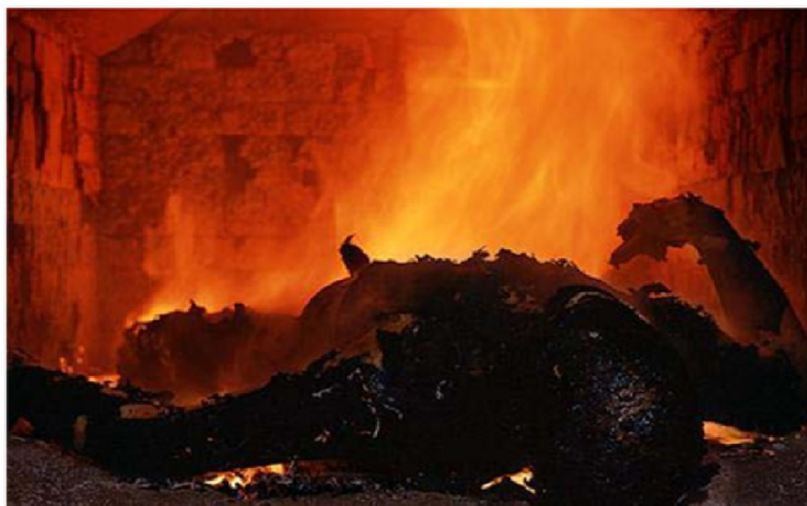
A dead body inside an industrial furnace that is able to generate temperatures of 870–980 °C (1600–1800 °F) to ensure disintegration of the corpse

(“Purified by Fire – A History of Cremation in America” by Stephen Prothero)