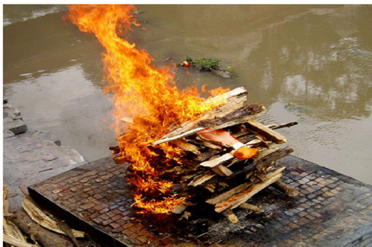
Cremation pyre on the bank of Bagamati in Nepal

The Cremation of Care is a ritual performance undertaken at the yearly Bohemian Grove club, where a mock child sacrifice is made to an approximate 40ft stone owl. The ritual involves club members, often high ranking businessmen and politicians, cremating (getting rid of) their care (moral compass) in order to clear their conscience for the year ahead. Source: http://wideshut.co.uk/cremation-of-care/