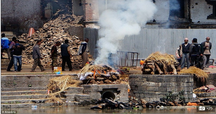
Despite the sheer number of victims, mourning families are desperate to give their loved one the honourable send-off so revered in the Hindu tradition

families – it can be proven that it also came from a pagan custom derived from an ancient pagan religious system.