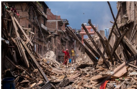
Nepalese earthquake victims search for their belongings among the debris of their homes on April 29, in Bhaktapur, Nepal.

recorded fatalities may exceed 15,000 lives. About 14,000 more have been injured, lacerated by flying glass, struck by plummeting concrete, half-crushed by collapsing walls.